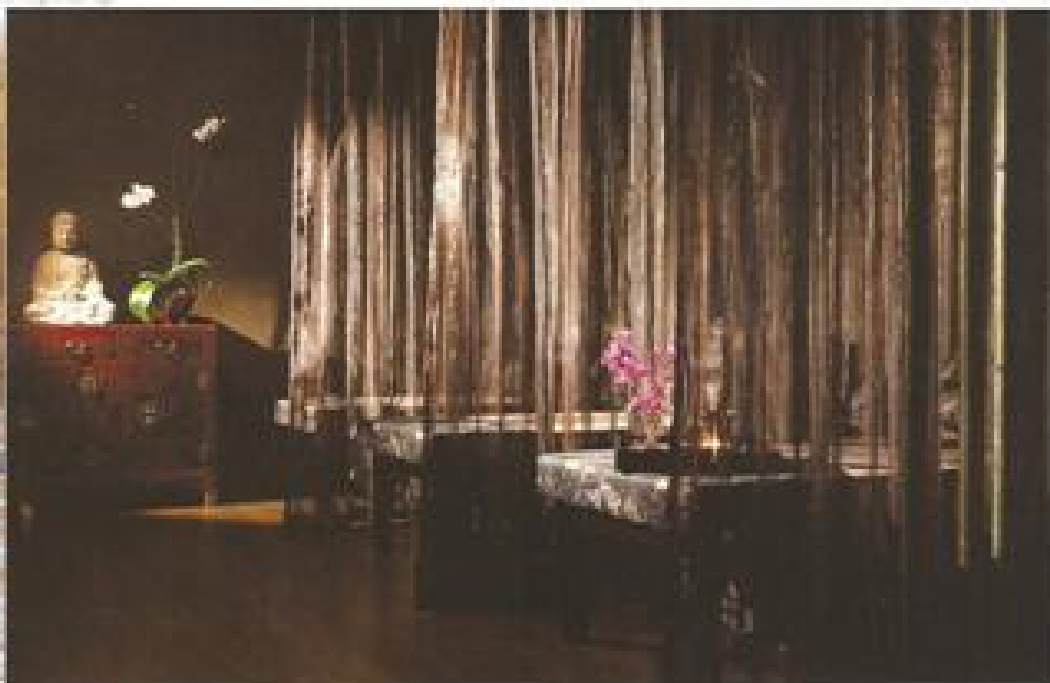
The Dream Room at Chuan Spa, The Langham, Auckland

"When we have large conferences here we certainly get delegates through. Having the Energy Events Centre close to us has been a real boon."